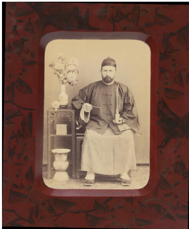
Western man in Hong Kong in Chinese costume c 1885

A Conference hosted by the Humanities Research Centre, RSHA, ANU in association with the National Gallery of Australia, Canberra.